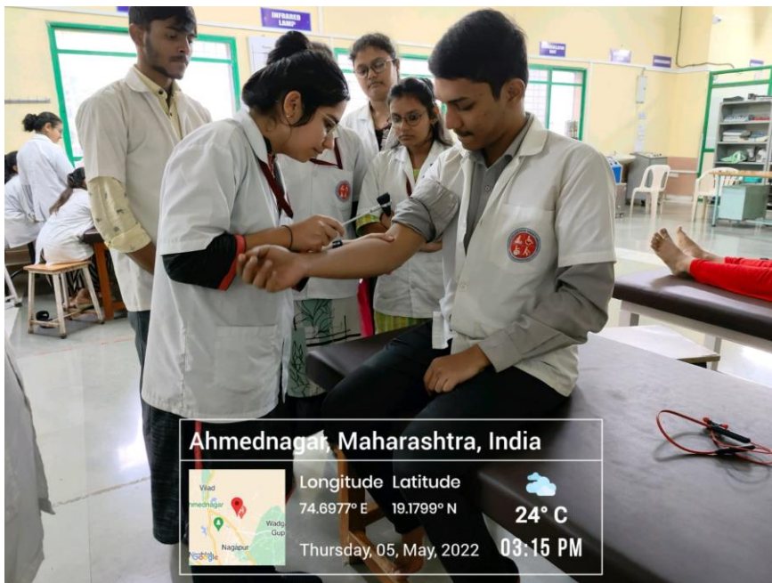
Biceps Brachii Reflex Testing