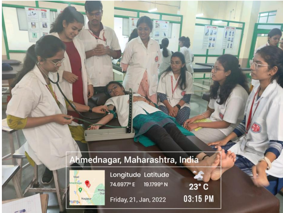
Skill training for measurement of Blood Pressure using manual Sphygmomanometer