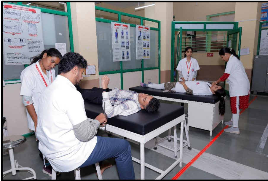
Goniometry for Elbow Joint