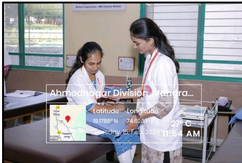
Ultrasound for Elbow joint