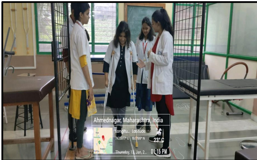
Gait training using Crutches